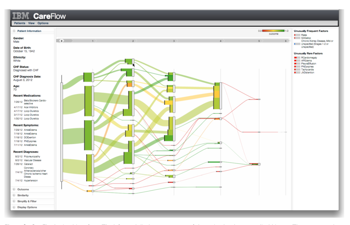
Figure 2: CareFlow's visual interface. The left panel displays a summary of the patient's relevant medical history. The center panel displays a visualization of the care plans of the 300 most similar patients. The right panel displays the factors associated with a selected subset of patients.