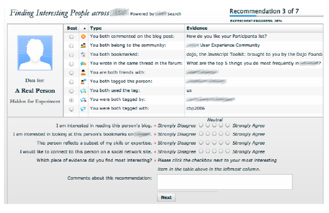
Figure 1. The experimental interface

For each single source based recommendation, up to nine evidence items are presented – all of the same source. For each recommendation based on a category ( people , places , or things ) up to three evidence items of each of its three sources are presented. For a recommendation based on aggregation of all sources, up to one evidence item is presented of each source. For a given participant and a given similarity configuration, we choose the recommended person to be the one with most evidence items from the list of top 100 similar people. Since we consider avid social media users, for many of the recommendations nine evidence items can be shown. When it is not the case, we present the maximum number of items that follow the conditions above.